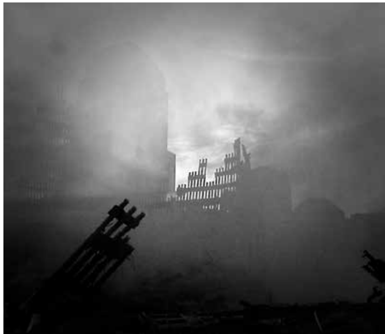
You could hardly see the sun through the smoke and haze at Ground Zero.

The incoming squad officers, including me, met with the departing squad officers to exchange information. The scene was chaotic. Most of the Fire Department of New York