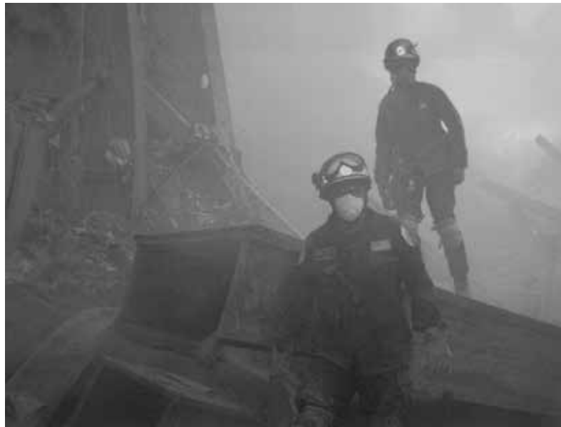
Unknown rescue workers walking in the toxic haze.

We were somewhat appeased when we were told the reason why. Between the attacks on New York City and the Pentagon along with the Shanksville, Pennsylvania crash site, all of the Federal Urban Search and Rescue teams were either already deployed or enroute to one of those locations. There was concern that should they be needed again, no FEMA - US&R teams would be available if a follow-up attack occurred. Since we were the first team in the field and the closest to our home base, we were sent back to