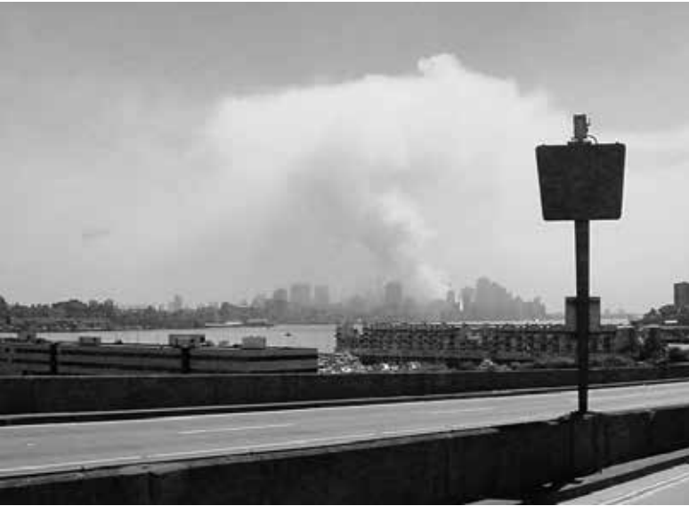
View from the bus on approach to New York.

familiar to me as we had worked other disasters before.