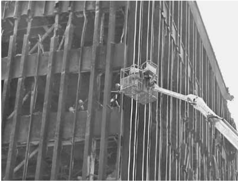
Miles, along with a FEMA Search Dog Handler (and a search dog), on the way up to search Building 4. Entry from the ground was impossible due to the stairwell being destroyed.

removed by others. We were not there to remove the dead. We were there to save the living.